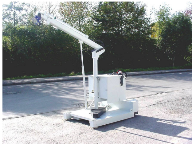
SO E 28857, EGKS 500, Load capacity 600 kg 400 kg free projection 1180 mm 2150 mm and hook height 1060-2600 mm 770-3150 mm swivel range hydraulic slide left/right 90°