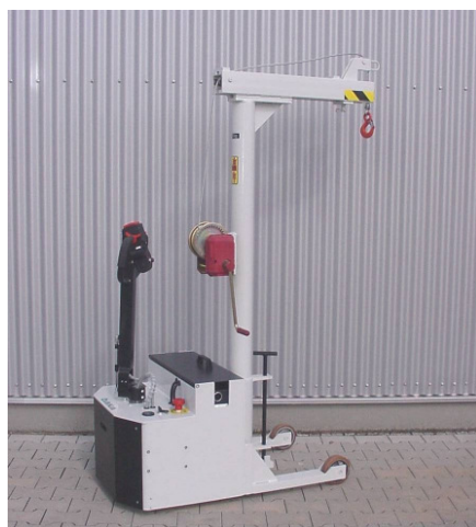
SO E 29566, EGV 60-1010 SO, Load capacity 350 kg to projection 800 mm, ejector 500 mm, hook height 100-1800 mm, extension, can be pivoted manually 10° from centre position