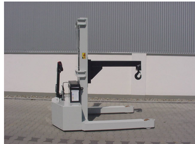
SO E 29340, EGP 3000, Load capacity 3000 kg at load centre distance 1200 mm, Lift height 300-1900 mm, mobile base outside width 1620 mm, safety load hook rotatable 360°