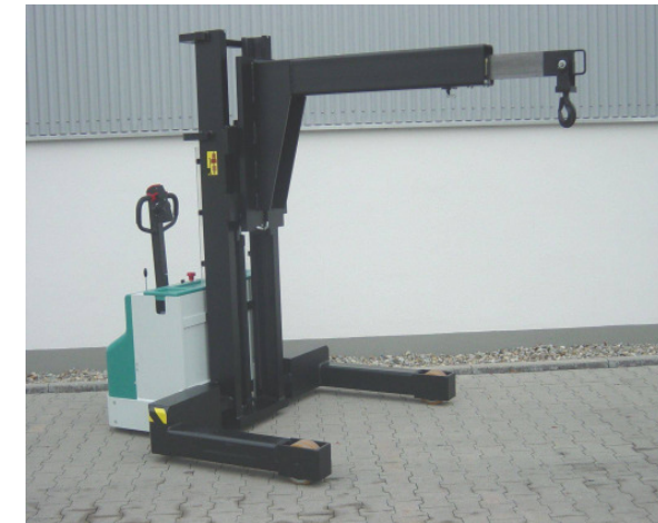
SO E 29808, EGV 2000-16, Load capacity 1500 kg / 120 kg, projection 1500 mm / 1800 mm, Lift height 700-2200 mm, manually ejector 300 mm