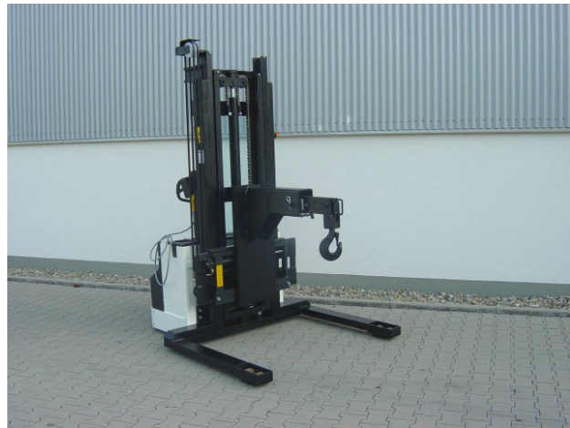
SO E 29875, EGV 2000-34, Load capacity 2000 kg at load centre distance 800 mm, hydraulic side slide +/- 200 mm, lifting height centre load hook 700-4000 mm, hydraulic control proportional using control unit