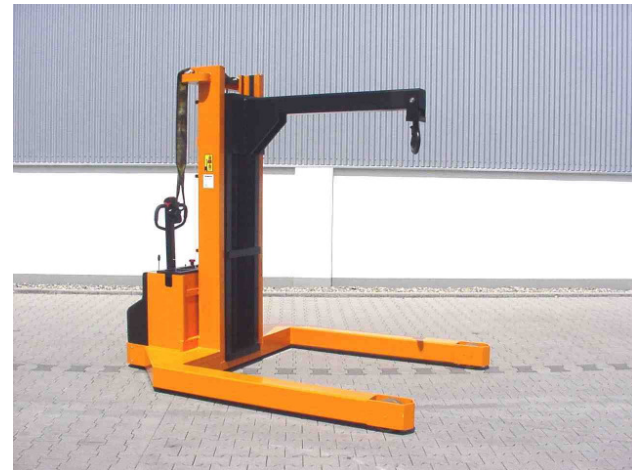
SO E 30269, EGV 2500-34, Load capacity 2500 kg at load centre distance 1400 mm, lifting height centre load hook 1800-3400 mm, broad gauge wheel arms 1920 mm