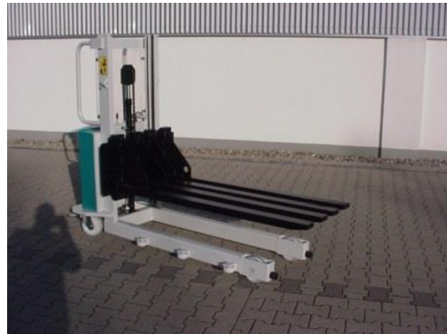
SO E 30469, E 60-1020 B, Load capacity 1000 kg at load centre distance 1100 mm, Lift height 320-1300 mm, Fork length 1700 mm, Wheel arms with lateral guide rollers , mechanical drop locks