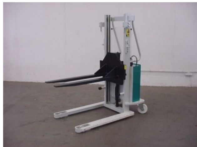
SO E 30446, E 60-1020 B, Load capacity 500 kg at load centre distance 775 mm, Lift height 700-1250 mm, Fork length 1180 mm