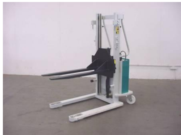
SO E 30445, E 60-1020 B, Load capacity 750 kg at load centre distance 904 mm, Lift height 700-1250 mm, Fork length 1140 mm