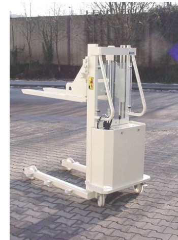
SO E 29321, E 60-1020 B, Load capacity 1000 kg at load centre distance 910 mm, Lift height 160-1310 mm, Fork length 1360 mm, mechanical drop locks , Wheel arms with guide rollers