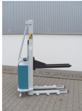
SO E 31187, E 60-1020 B SO, Load capacity 600 kg at load centre distance 650 mm, Lift height 200-1600 mm, Fork length 1000 mm,