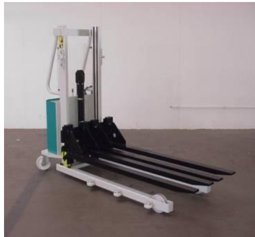
SO E 29922, E 60-1020 B, Load capacity 1000 kg at load centre distance 1200 mm, Lift height 320-1300 mm, Fork length 1800 mm, Wheel arms with lateral guide rollers , mechanical drop locks