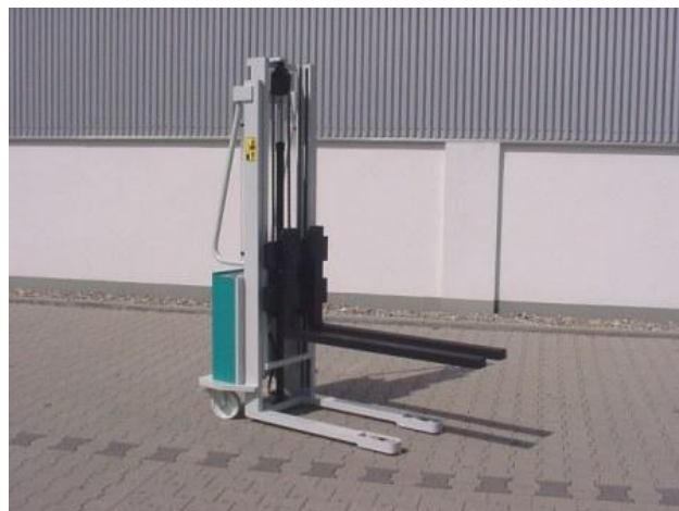
SO E 30373, ET 79-1020B, Load capacity 1000 kg at load centre distance 600 mm, Lift height 70-2780 mm, Fork length 1200 mm