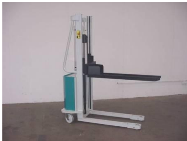
SO E 30067, E 60-1020 B, Load capacity 600 kg at load centre distance 800 mm, Lift height 90-1250 mm, Fork length 1250 mm