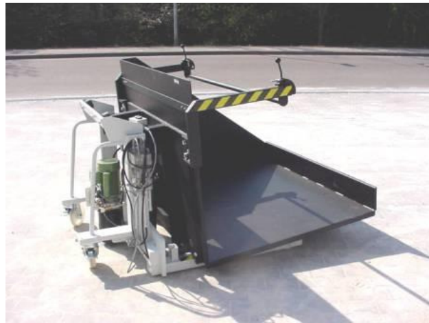
SO E 28965, BKE 1,5, Load capacity 1000 kg, Tilting degree 110°, Emptying height ca. 900 mm, Platform LxW 1550x1250 mm, push button control on 2m cable, 230 V mains hydraulics