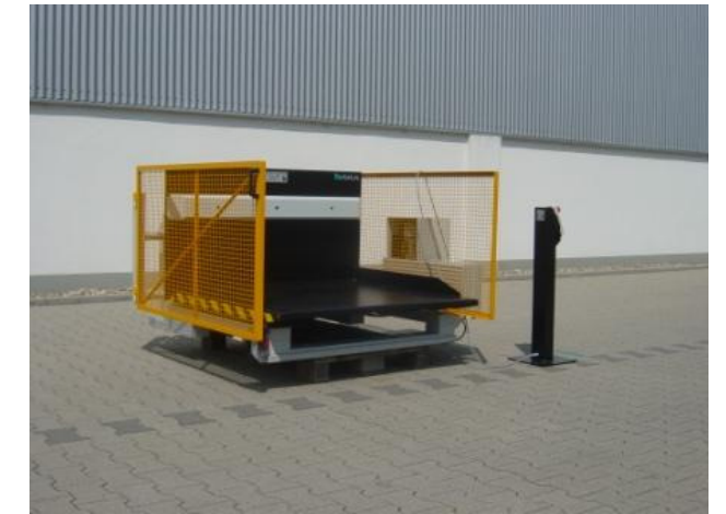
SO E 30989, BKE 1,5 SO, Load capacity 1500 kg, Tilting degree 90°, Emptying height at 90° ca. 894 mm, Board form length /-width 1070x1300 mm, push button control point on vertical column, 230 V mains hydraulics