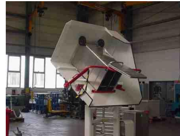
SO E 30713, BKE 0,5 SO, Load capacity 400 kg, Emptying height ca.1200 mm, tipping angle ca. 130°, push button control on 5m cable, 230 V mains hydraulics