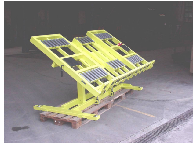
SO E 28922, electrical tilting device, Load capacity 1000 kg, Inclination 10°, Carrier rollers vertical or horizontal, Horizontal position 1015 mm, Table LxW 1500x2500 mm, Track gauge 2000 mm,