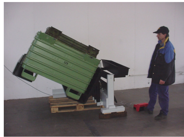
SO E 30477, BKE 2,0, Load capacity 2000 kg, Tilting degree ca. 80°, stationary version, operation with foot button on 2m cable, 230 V mains hydraulics