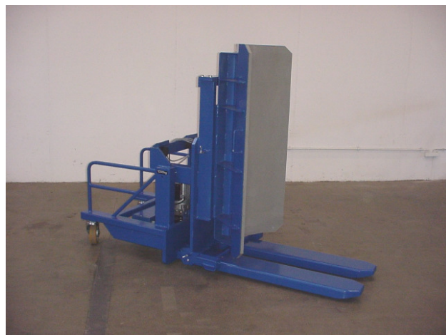
SO E 29971, BKE 1,5, Load capacity 1000 kg, Tilting degree ca. 90°, height pivoted at 90° 1095 mm, fork length 1150 mm, Fork load width 560 mm, 230 V mains hydraulics