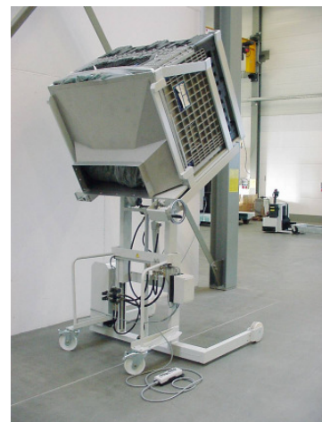
SO E 29243, BKHE 0,5, Load capacity 500 kg, Emptying height 950-1450 mm with initial lift, Tilting degree 125°, pivotable V2A cowling with outlet, 230 V mains hydraulics