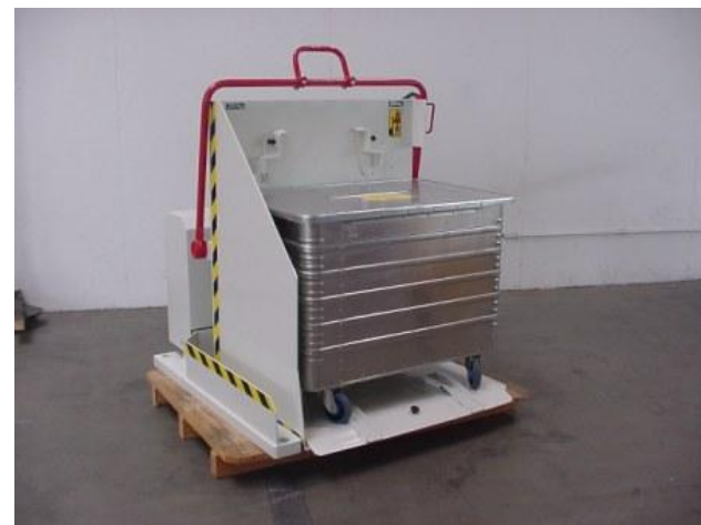
SO E 30262, BKE 0,5 SO, Load capacity 250 kg, Emptying height ca. 1000 mm, tipping angle ca. 120°, adjusted for two container sizes, push button control on 5m cable, 230 V mains hydraulics