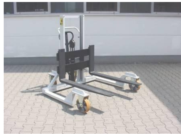
SO M 20679, M 1000-09.2 SO, Load capacity 1000 kg at load centre distance 600 mm, Lift height 45-1000 mm, Fork length 1200 mm, fork carrying width adjustable up 300-900 mm, solid slider fork