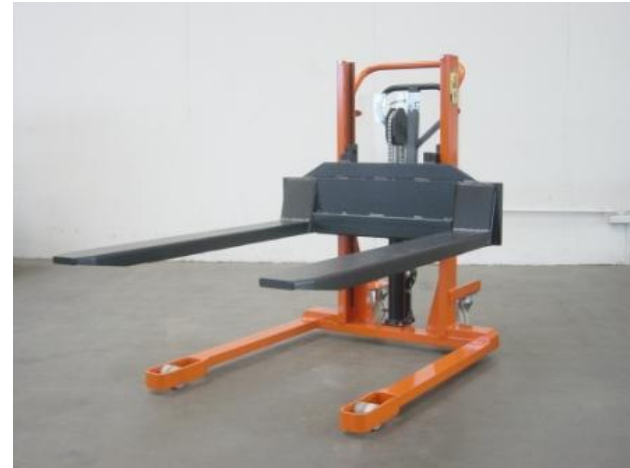
SO M 22304, M 1000-09.1, Load capacity 1000 kg at load centre distance 600 mm, Lift height 90-900 mm, Fork length 1300 mm, Fork carrying width 1000 mm