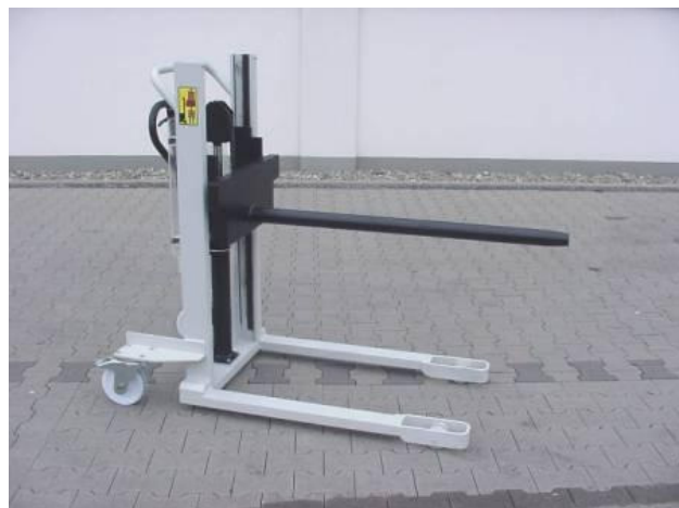
SO M 20551, M 1000-09.1, Load capacity 600 kg at load centre distance 680 mm, lifting height mandrel 120-1000 mm, suitable for paper rolls with diameter 550 mm, mandrel diameter 60 mm