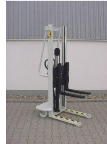
SO M 21763, M 60-1020 SO, Load capacity 1000 kg at load centre distance 350 mm, Lift height 50-1560 mm, Fork length 550 mm, FEM fork holder with special fork arms