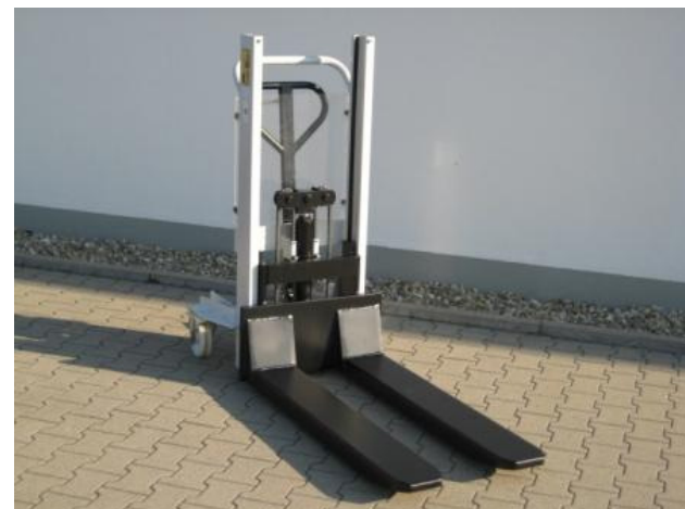
SO M 22938, M 1800-09.1, Load capacity 1800 kg at load centre distance 600 mm, Lift height 90-900 mm, Fork length 1120 mm, Fork carrying width 580 mm