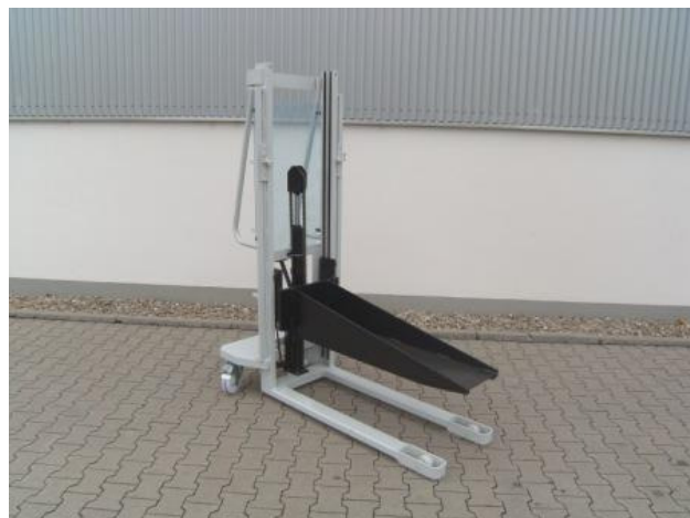
SO M 22287, M 60-1020 SO, Load capacity 200 kg at load centre distance 1500 mm, Lift height fork 90-1400 mm, 1 fork arm length 1200 mm