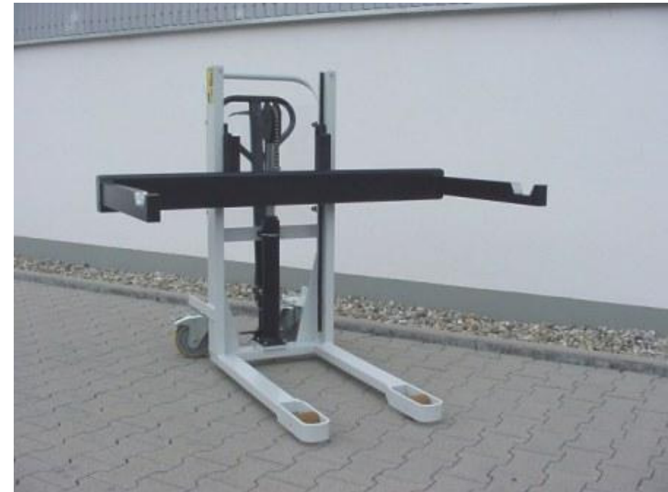
Manual fork lift / Palette lifter