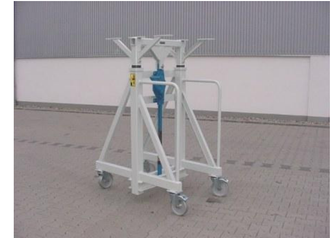
SO M 20119, Load capacity 2000 kg, lifting with lifting jack, 4 cast iron guide rollers, for lifting and transporting ceiling boarding elements