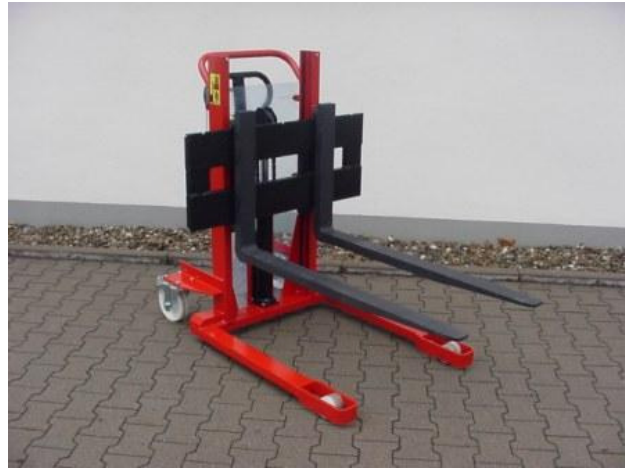
SO M 21836, M 1000-09.1 SO, Load capacity 1000 kg at load centre distance 600 mm, Lift height 60-840 mm, Fork length 1150 mm, Fork carrying width adjustable up to 900 mm, with broad gauge undercarriage